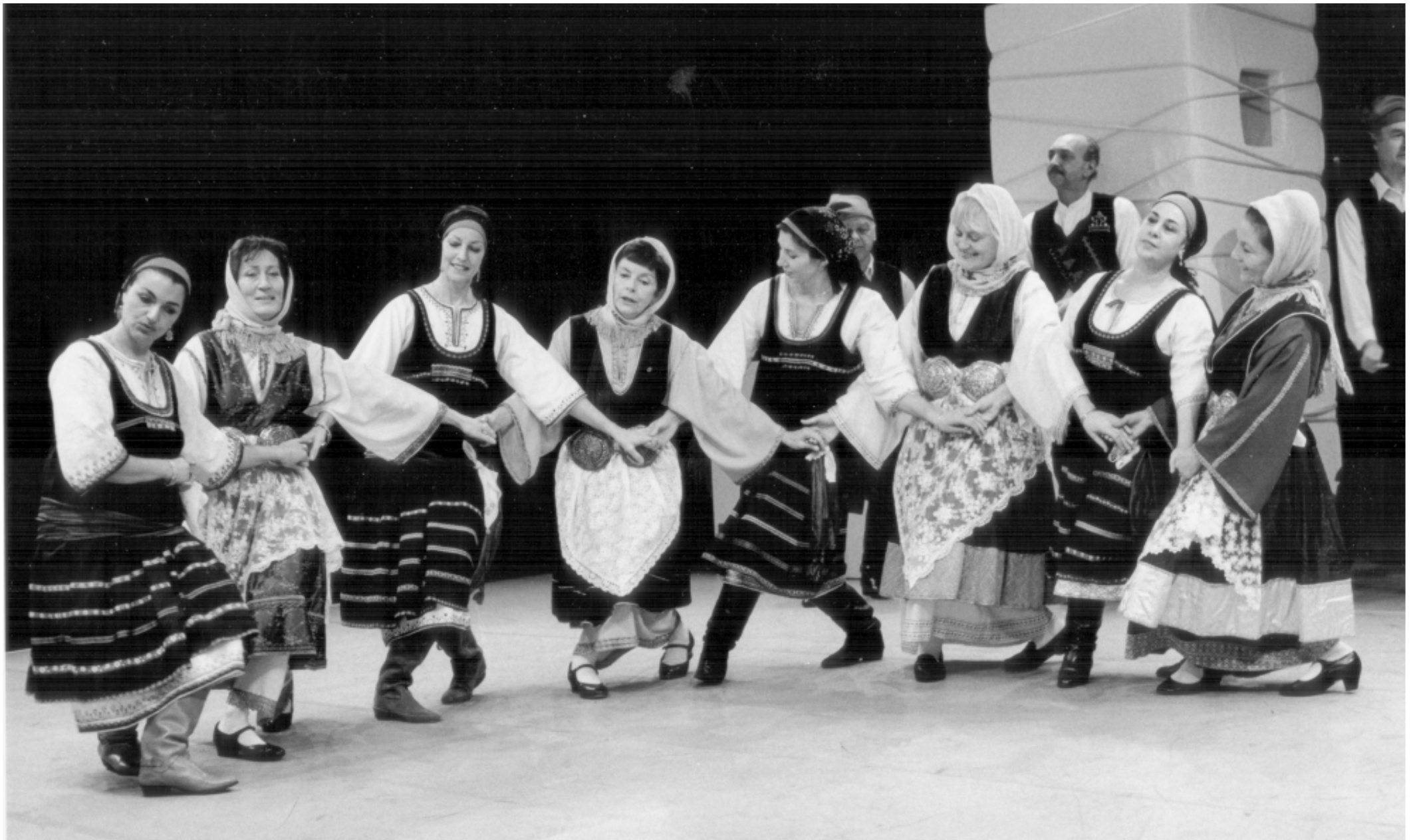
Performing at the Barbican - several years ago